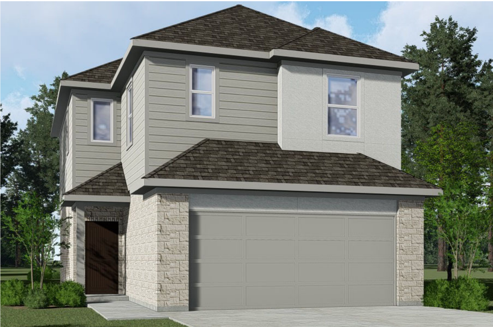
ELEVATION A - 1373 SQ.FT.