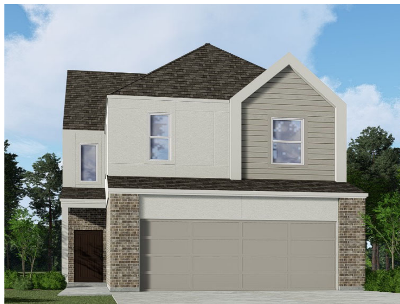
ELEVATION C - 1373 SQ.FT.