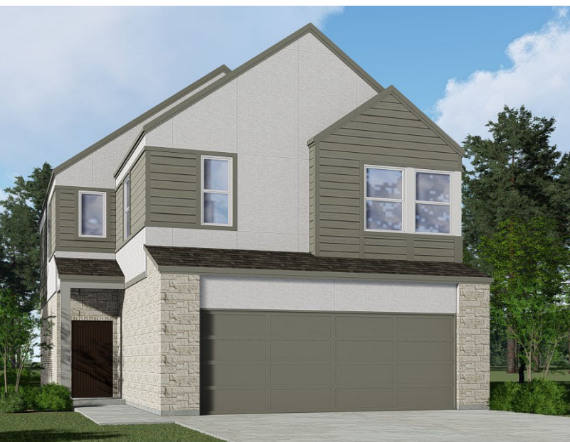
ELEVATION B - 1373 SQ.FT.