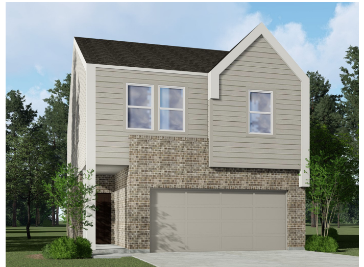
ELEVATION C - 1941 SQ.FT.