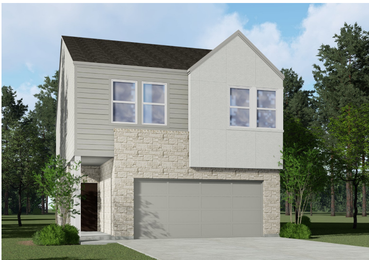
ELEVATION B - 1945 SQ.FT.