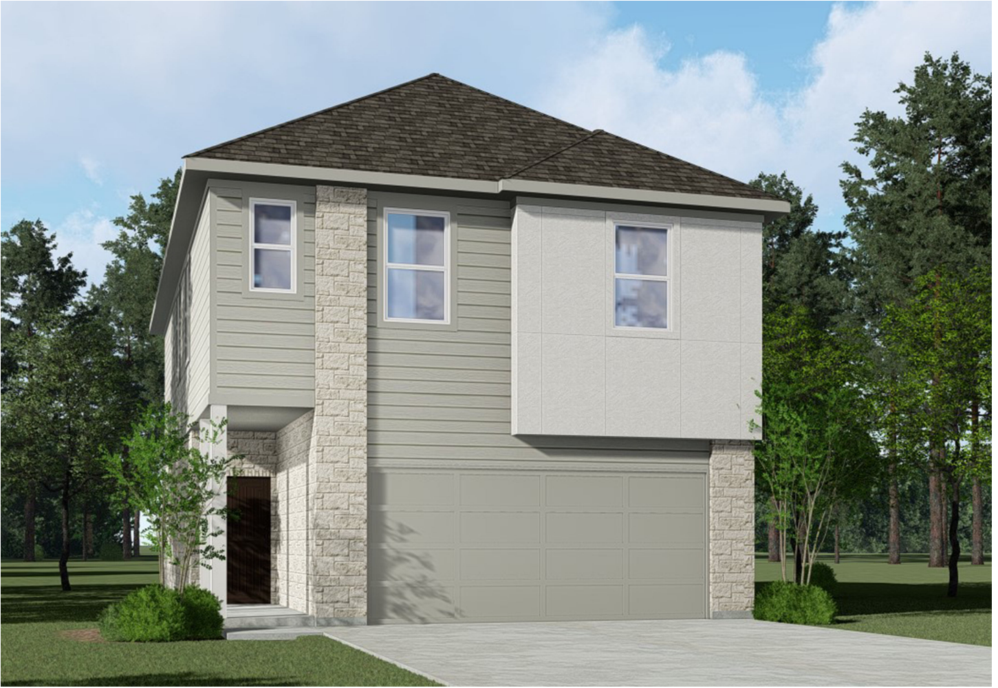
ELEVATION A - 1941 SQ.FT.