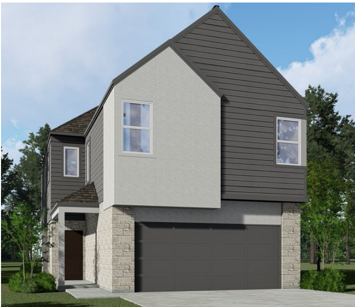
ELEVATION B - 1603 SQ.FT.