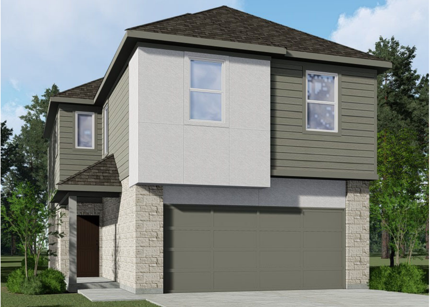
ELEVATION A - 1598 SQ.FT.