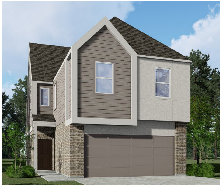
ELEVATION C - 1598 SQ.FT.