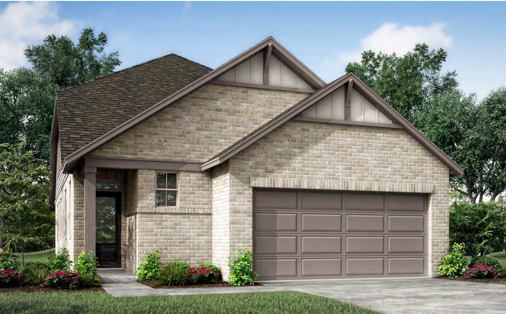
ELEVATION A - 2124 SQ.FT.