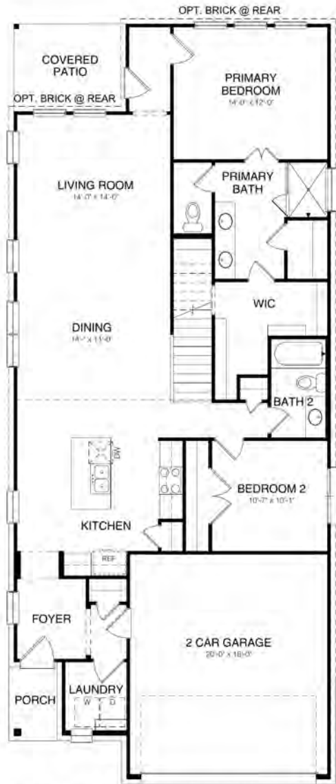
MAIN FLOOR PLAN ELEVATION A