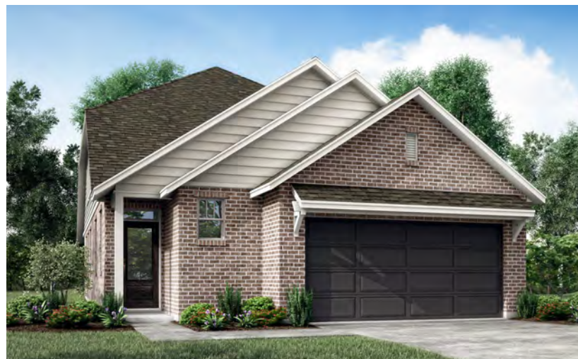
ELEVATION C - 2124 SQ.FT.