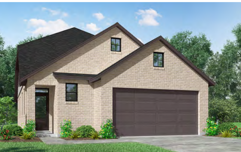
ELEVATION B - 2124 SQ.FT.