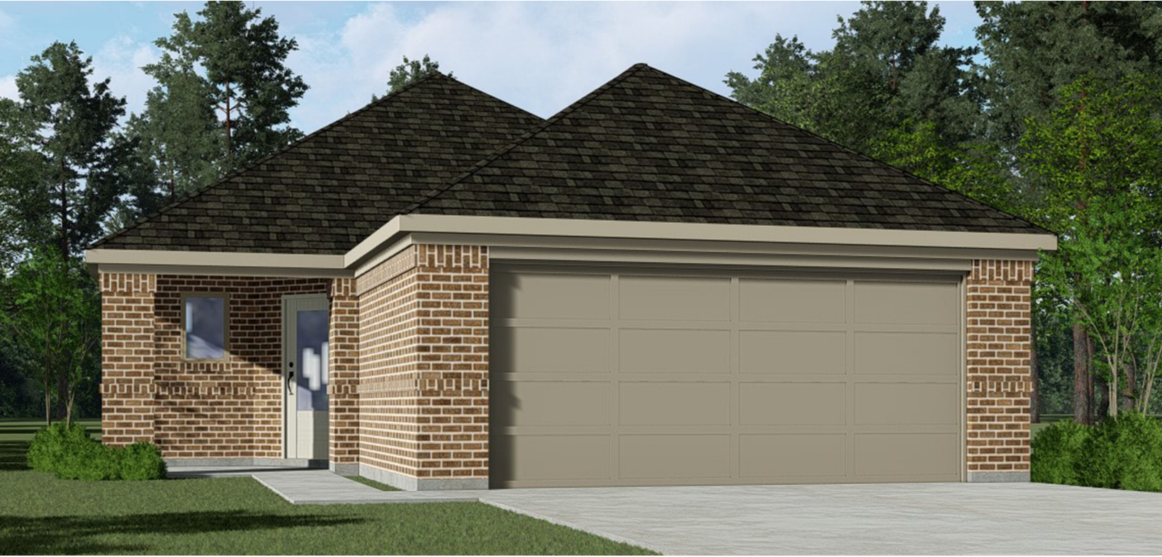
ELEVATION A - 1614 SQ.FT.