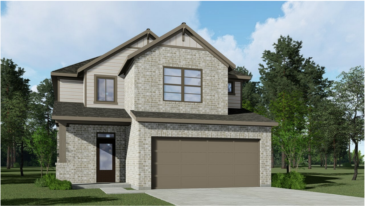
ELEVATION A - 2470 SQ.FT.