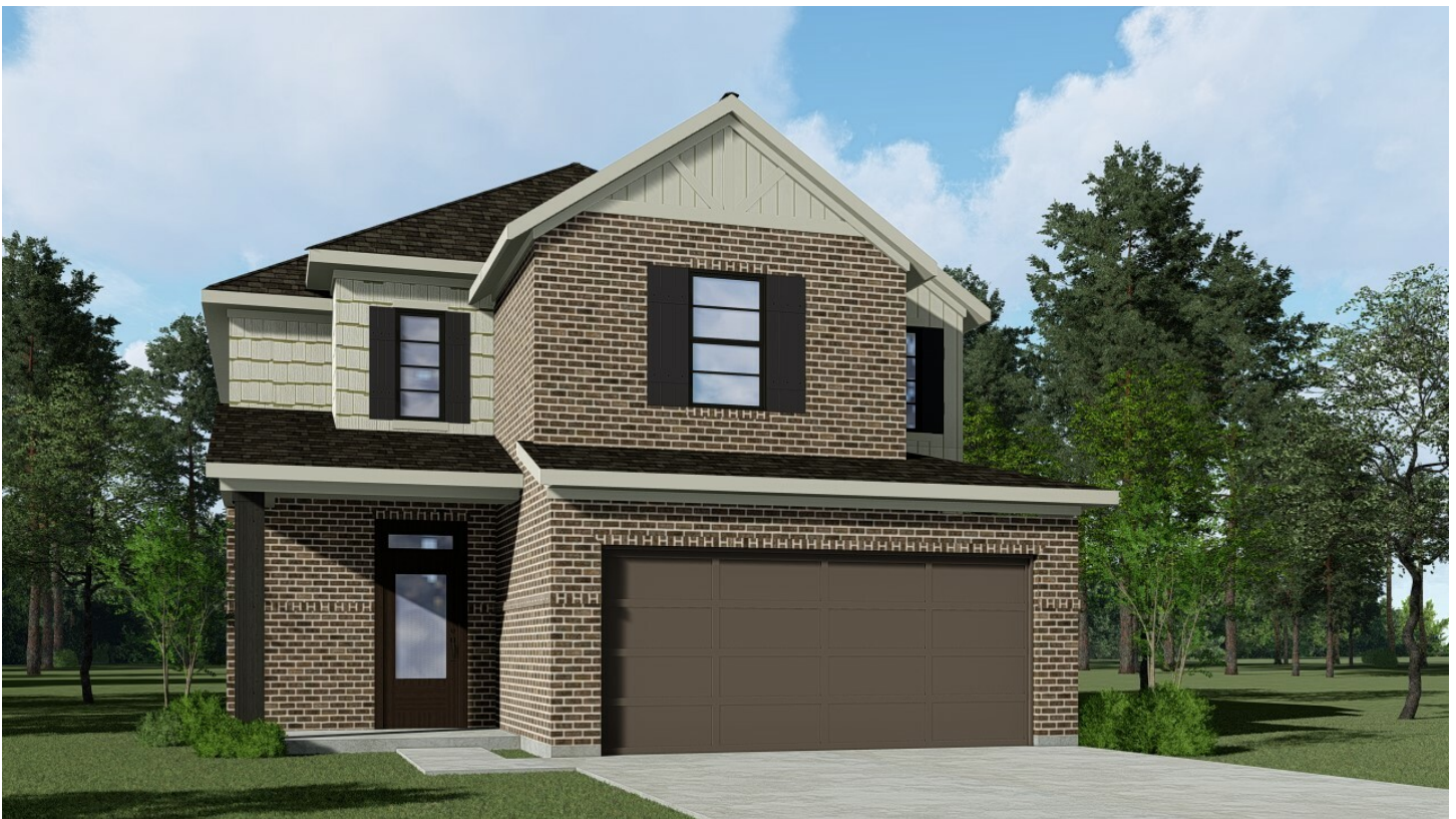
ELEVATION B - 2470 SQ.FT.