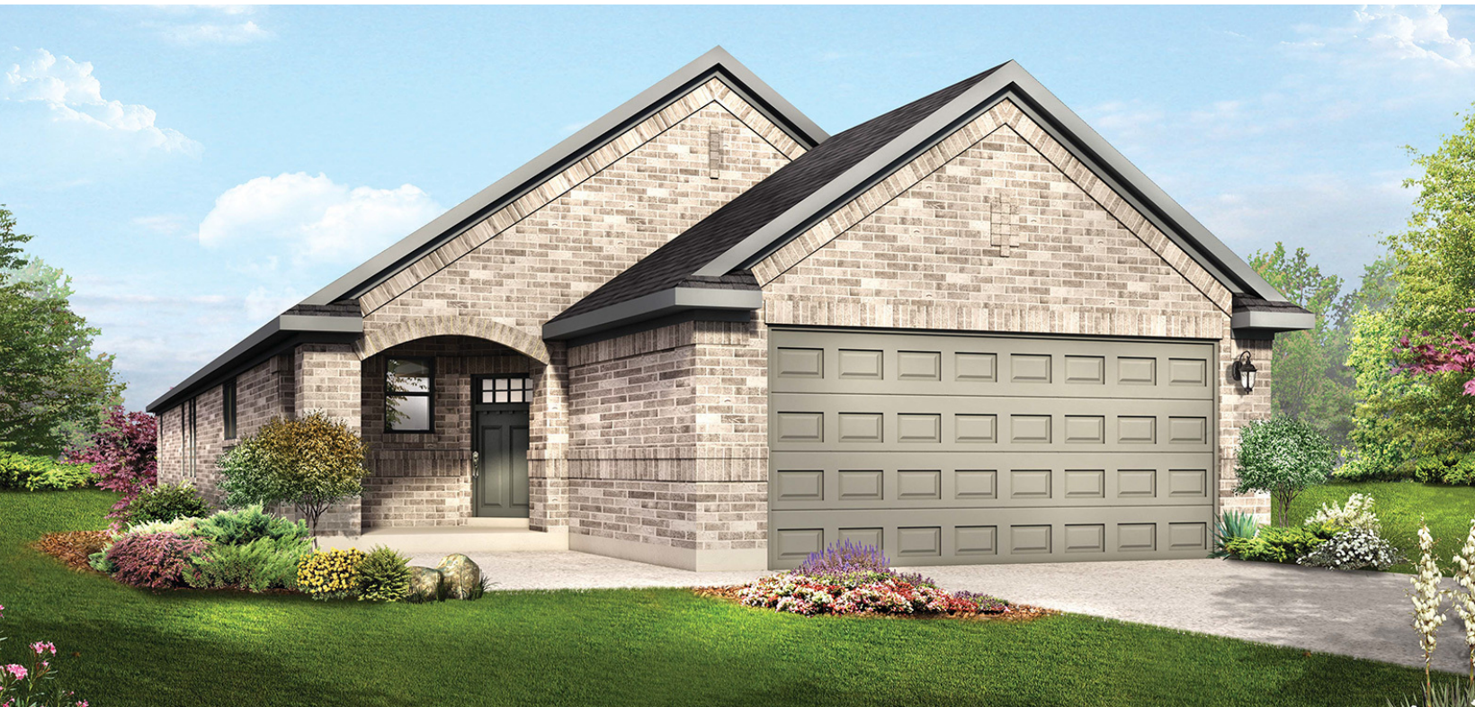
ELEVATION B - 1732 SQ.FT.