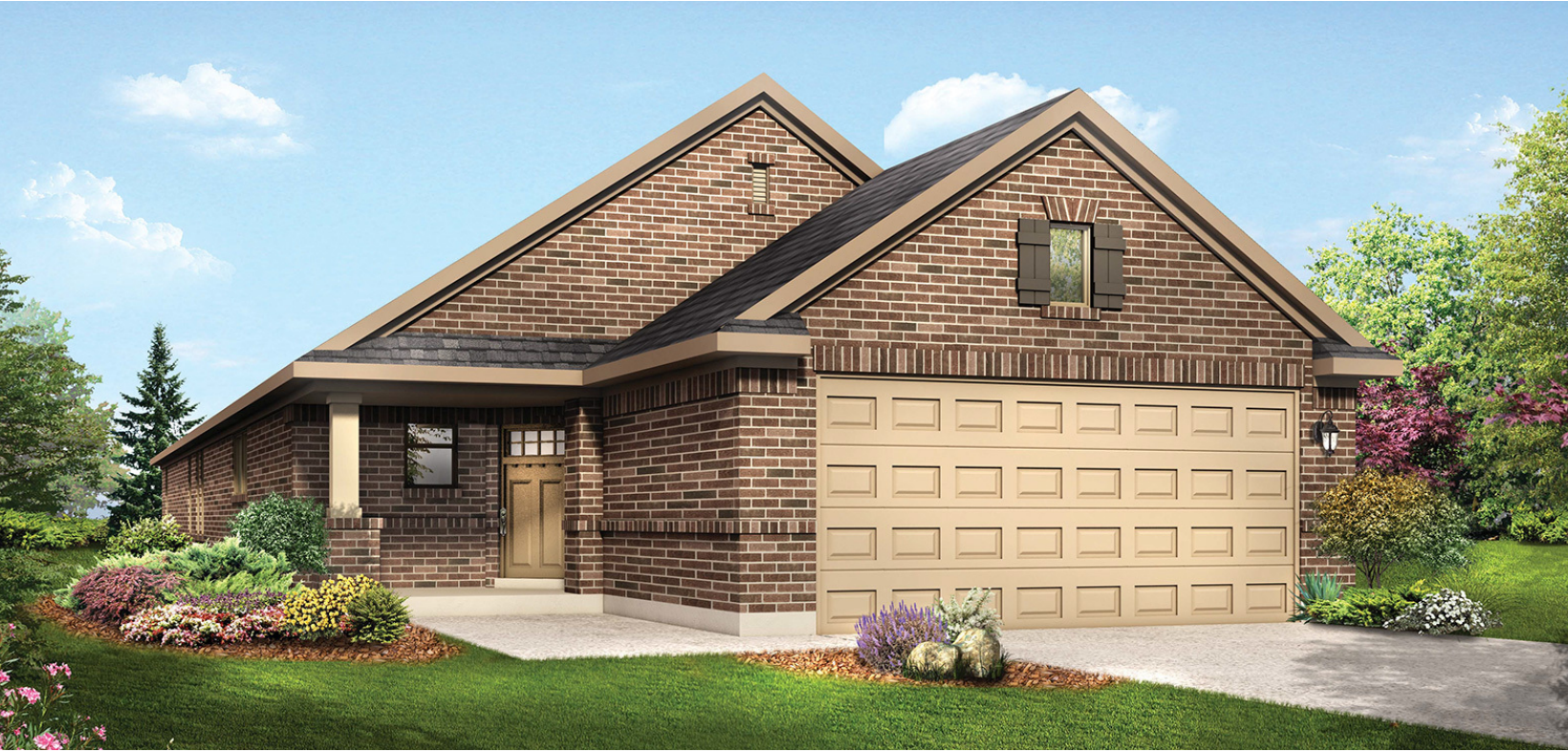
ELEVATION A - 1732 SQ.FT.