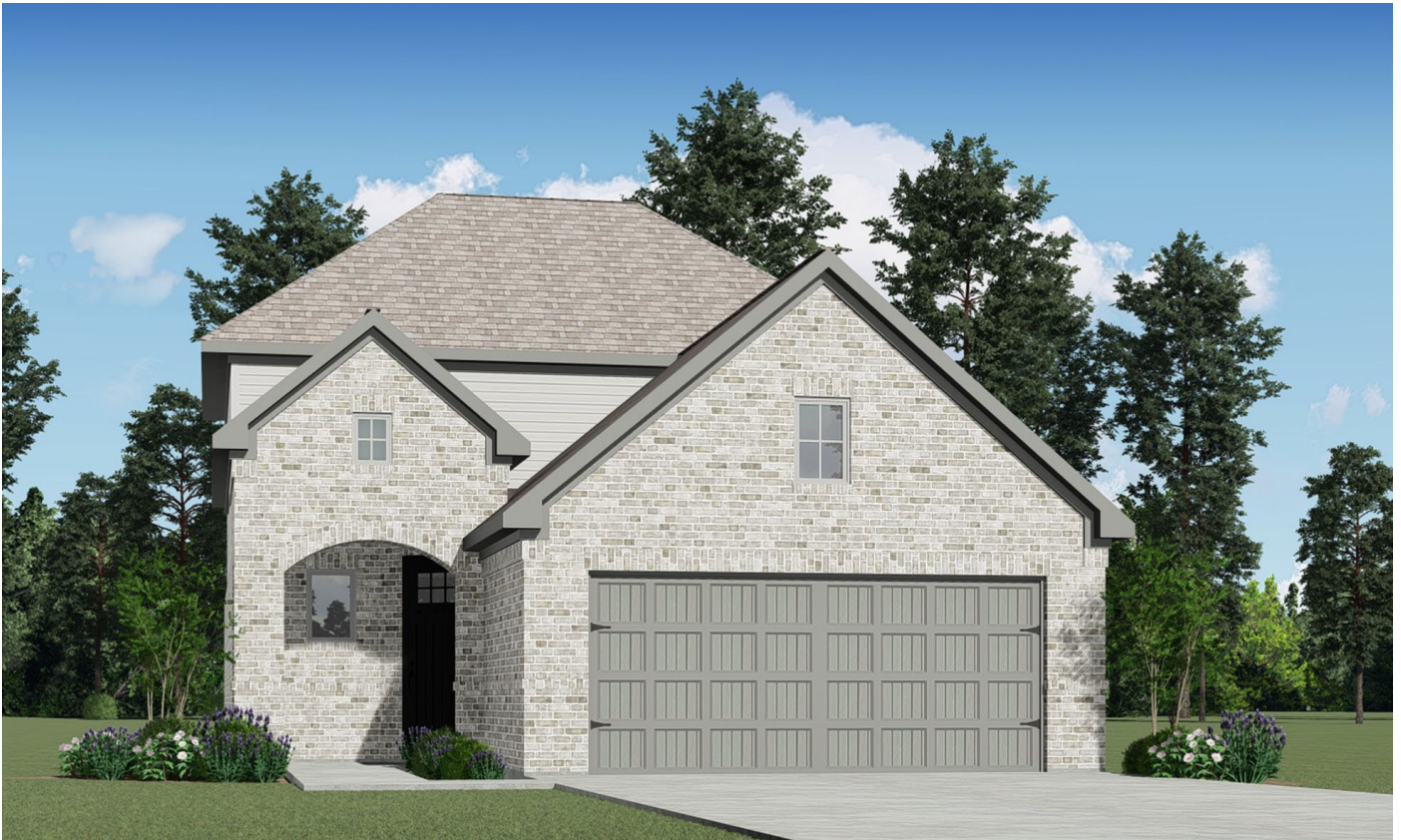
ELEVATION A - 2378 SQ.FT.