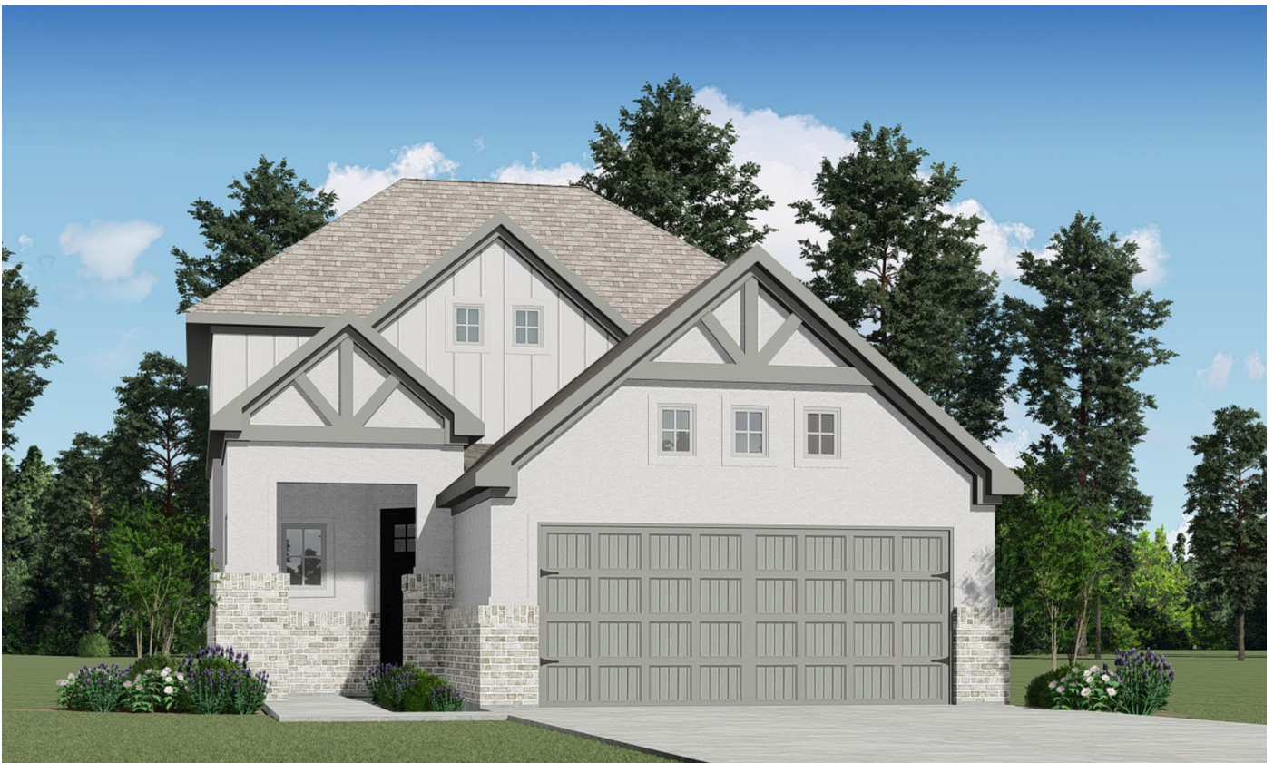
ELEVATION B - 2378 SQ.FT.