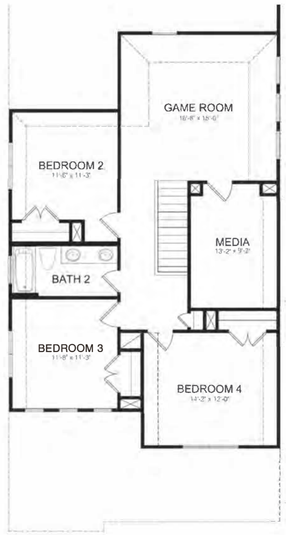
SECOND FLOOR PLAN ELEVATION A