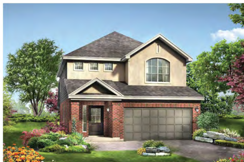
ELEVATION C - 2587 SQ.FT.