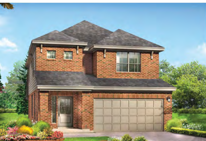
ELEVATION B - 2613 SQ.FT.