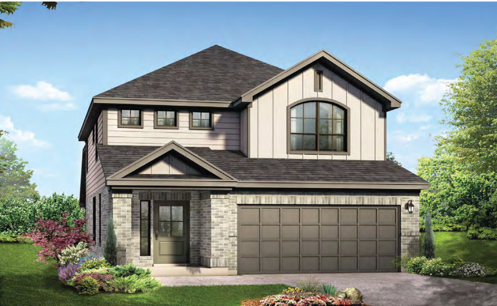
ELEVATION A - 2587 SQ.FT.