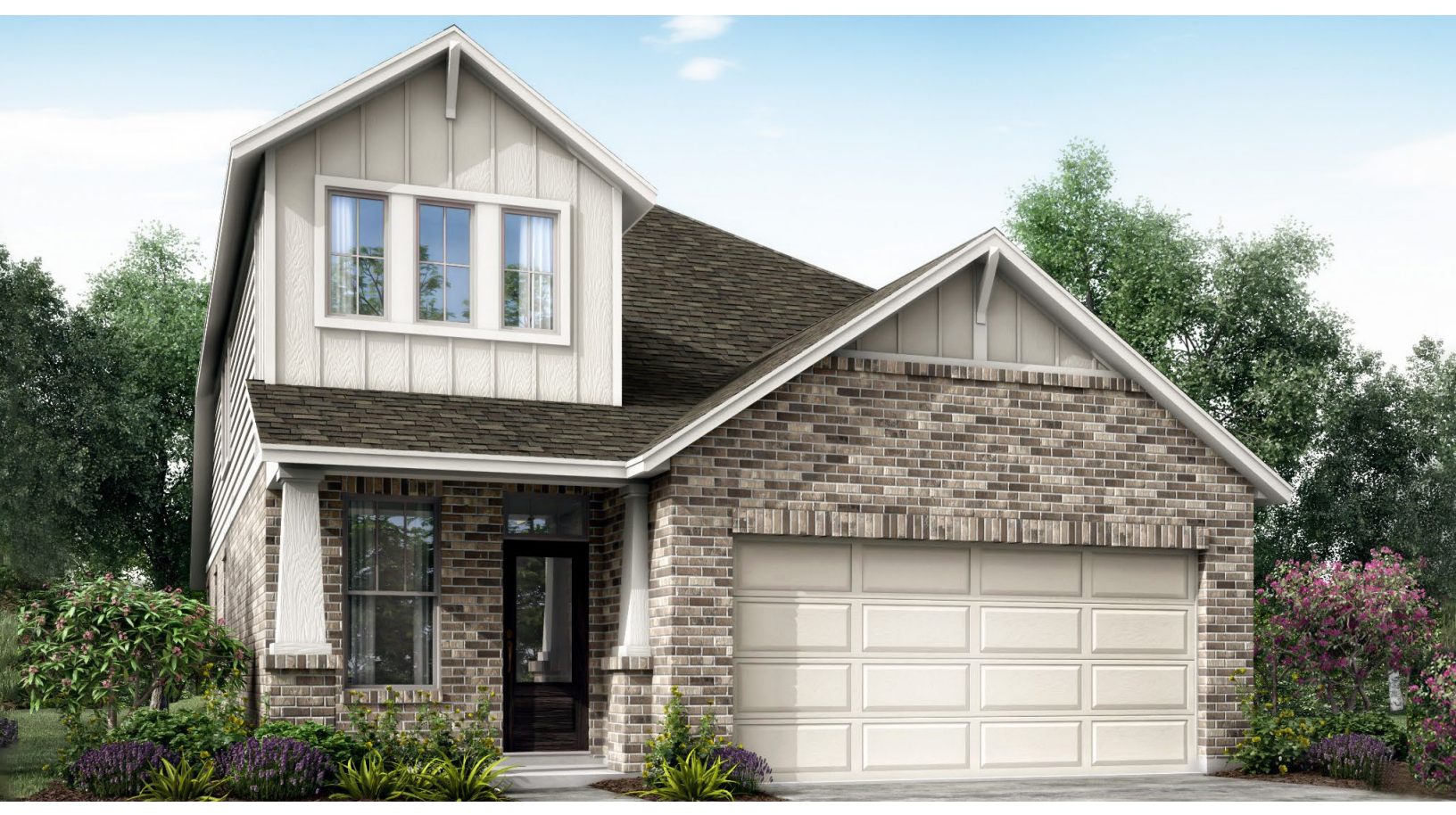
STYLE A - 2058 SQ.FT.