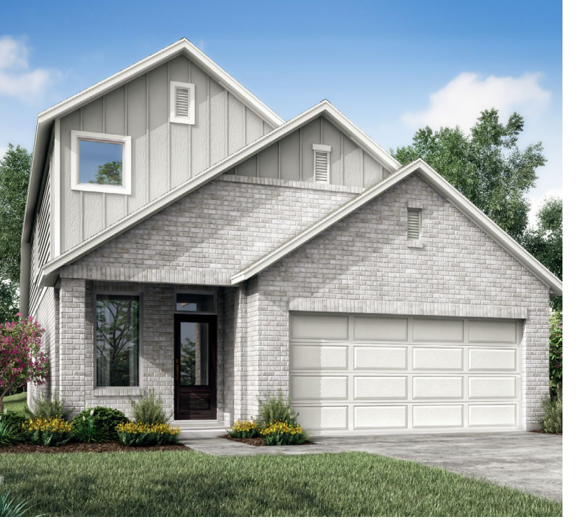
STYLE B - 2058 SQ.FT.