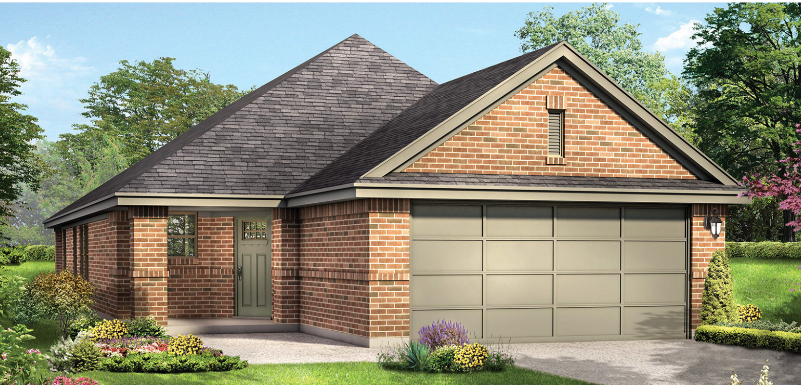
ELEVATION B - 1614 SQ.FT.