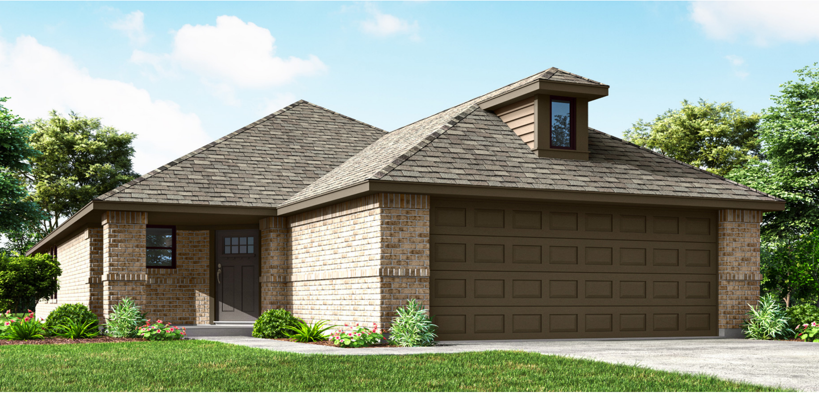
ELEVATION A - 1614 SQ.FT.