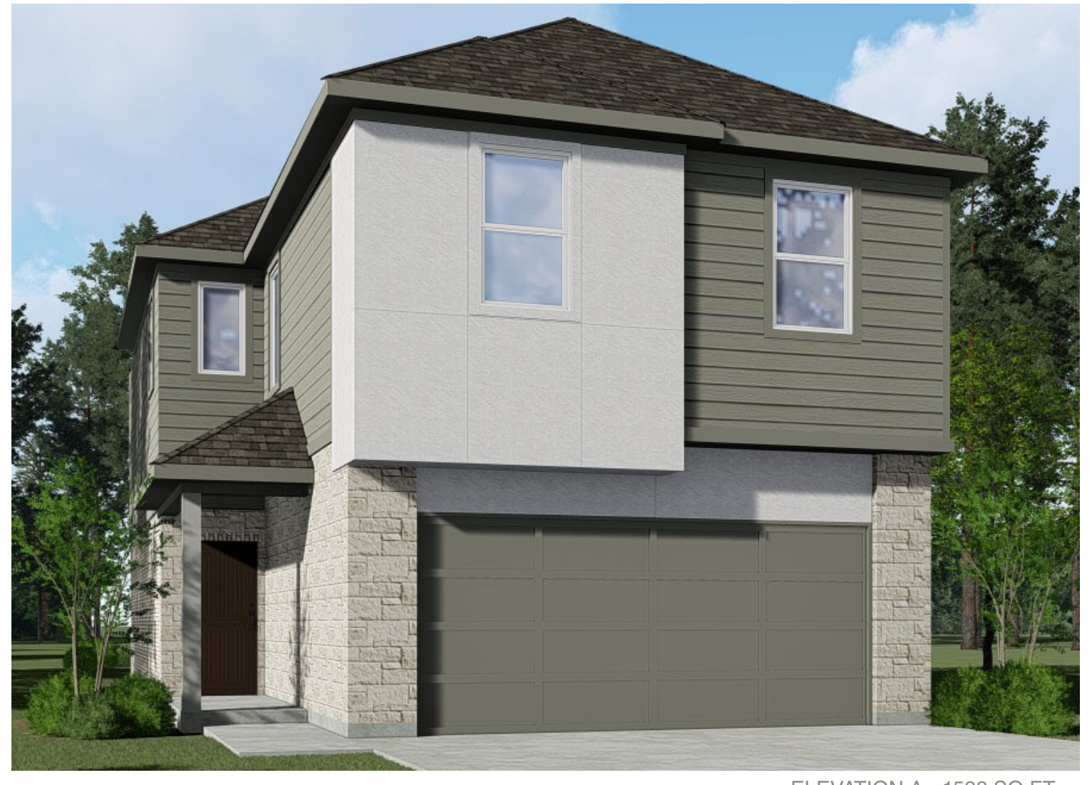
ELEVATION A - 1598 SQ.FT.