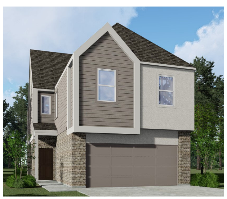
ELEVATION C - 1598 SQ.FT.