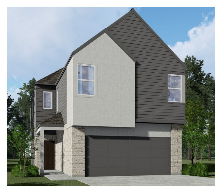
ELEVATION B - 1603 SQ.FT.