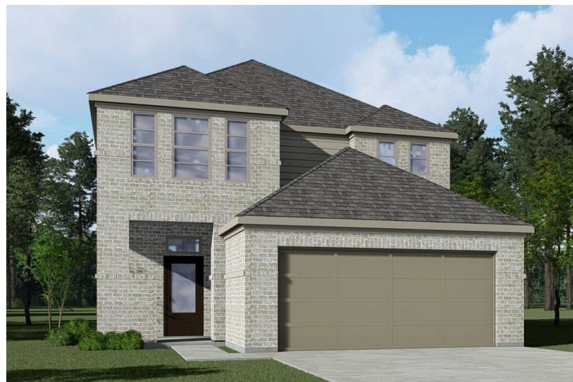
ELEVATION C - 2653 SQ.FT.