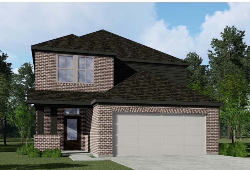
ELEVATION B - 2635 SQ.FT.