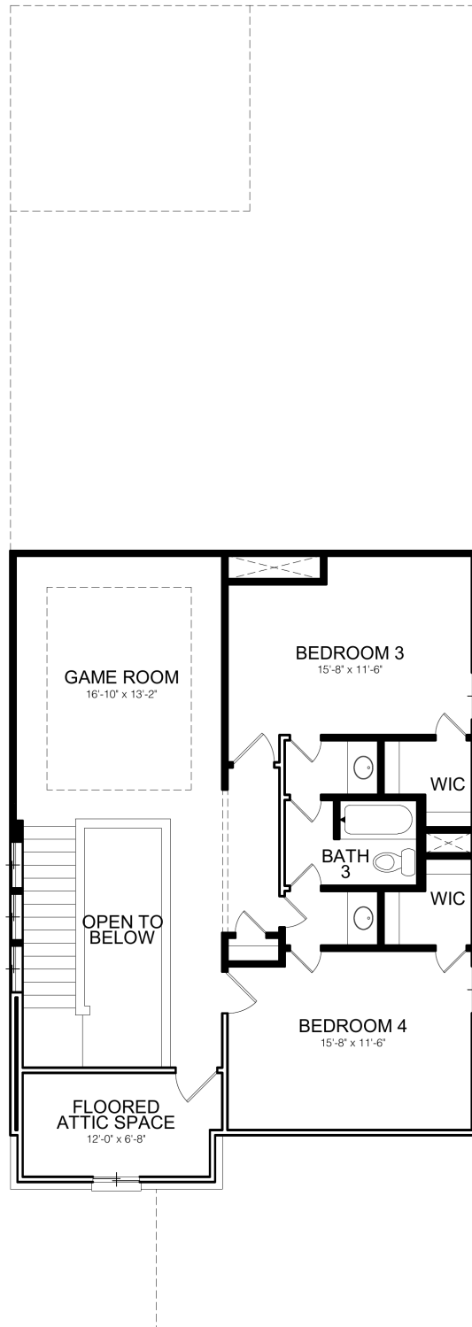
SECOND FLOOR PLAN ELEVATION A