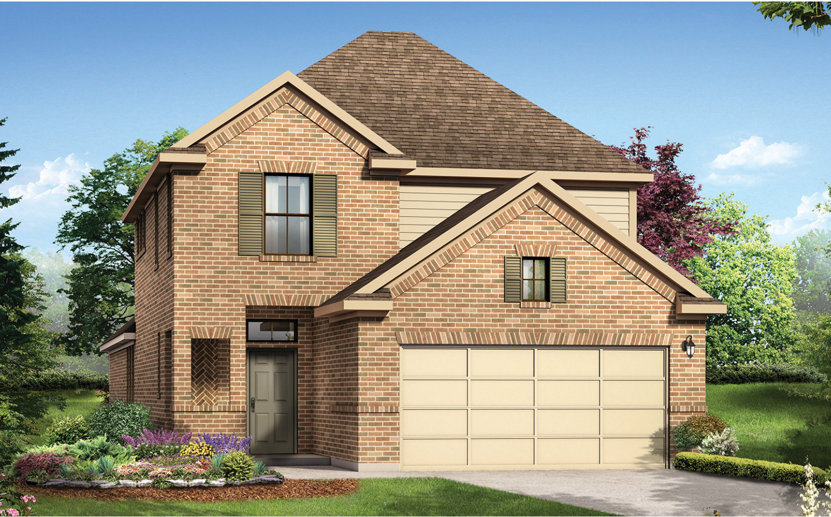
ELEVATION A - 2635 SQ.FT.