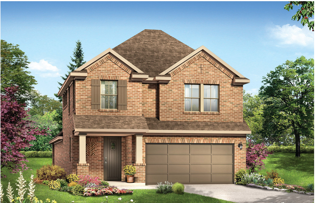
ELEVATION B - 2422 SQ.FT.