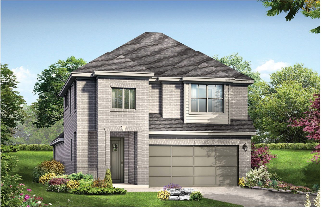
ELEVATION A - 2446 SQ.FT.